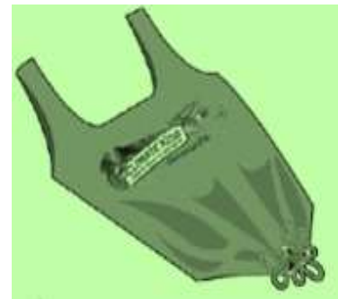
Steps 4-8- Insert the pin and strip, into the slits, up and down as you move onto the next slit. Insert all the strings. Remove the safety pins, pull the strings tight and tie a knot.