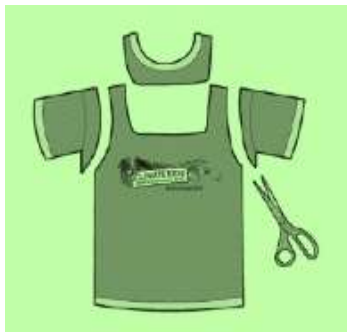
Step 2. Cut the neck and the sleeves